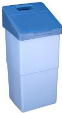
Example 45-litre Nappy Bin

The bins will be stored in a small area of approximately 1.5m x 0.5m. The area is to be cleaned and maintained twice per day. an appropriate number of receptacles and be disposed of separately to the general waste bins.